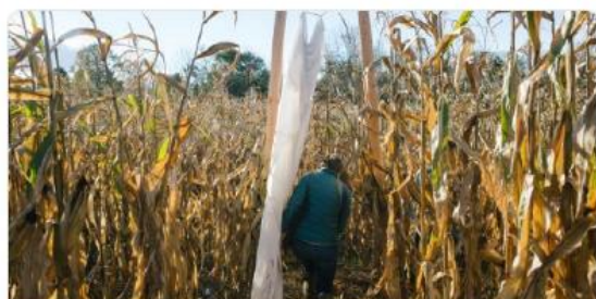
Bud Light Gets Eartul From Angry Corn Lobby After Super Bowl Ad Bud Light's Super Bowl campaign called out competitors that use corn syrup – and the corn lobby is not happy about it. bloomberg.com